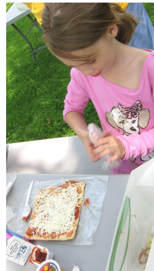
Feeding our Hungry Neighbors in Northern Illinois.